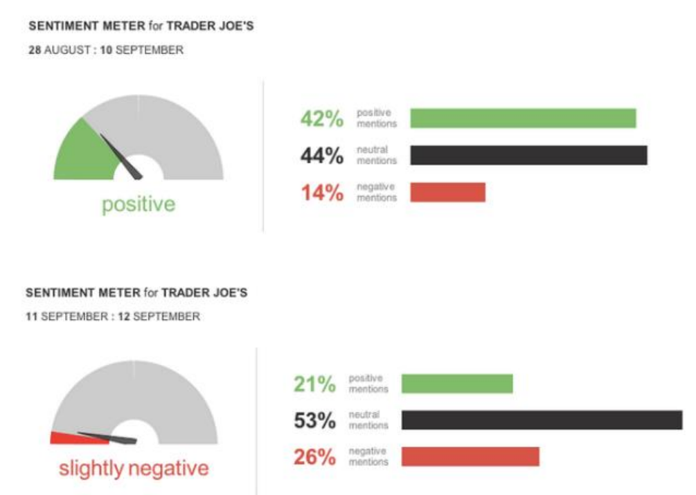
Figure 2: Improving Sentiments

The importance of having a favorable social media sentiment towards your brand, content, products, or goods and services cannot be over-emphasized, especially in terms of effective marketing. Hence, here are some tips on how to enhance social media sentiment;